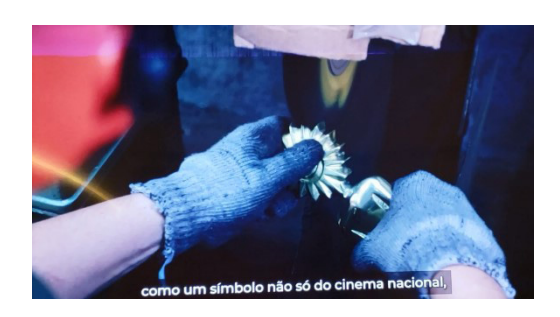
Figure 13. Image taken from the video about the Kikito on display at the Gramado Film Festival Museum

The video narrative highlights the meaning of this sculpture to the Film Festival and the city of Gramado, as illustrated by Figure 13, Figure 14 and Figure 15.