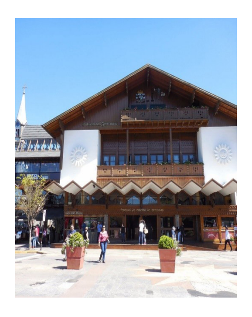
Figure 1. Palácio dos Festivais Building Credits. Manoela Barbacovi and Maria Angélica Zubaran

other's visitors. On the other hand, the Bavarian architectural style reinforces the tourist image of Gramado as a European city, as shown in the Figure 1.