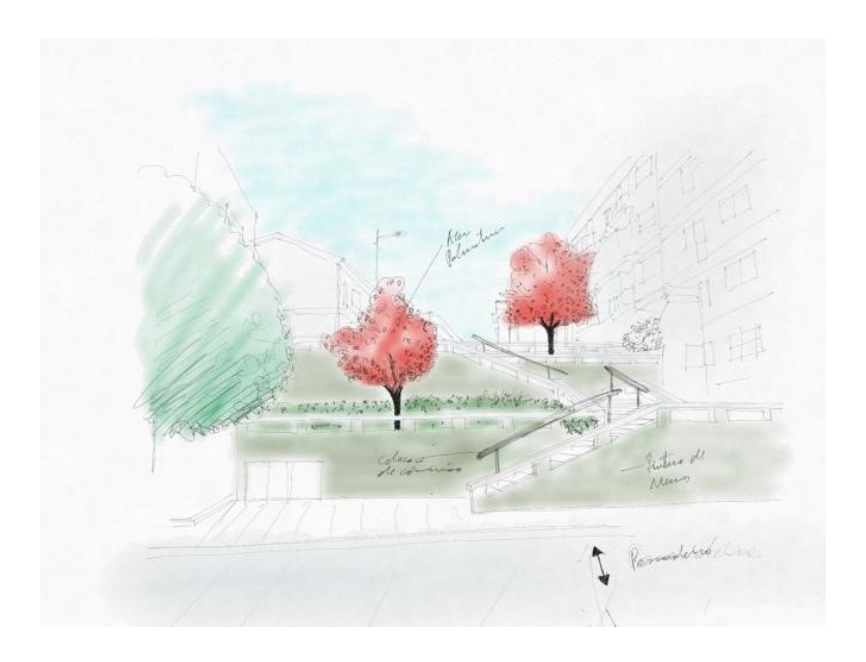
Figure 2. Draft of the Library neighbourhood intervention

The proposals for improvement were presented in a public discussion open to the whole community. One of the ideas presented (Figure 2) in that session was painting a mural on the stairs leading to Parque 1.° de Maio street, in front of Almeida Garrett Secondary School.