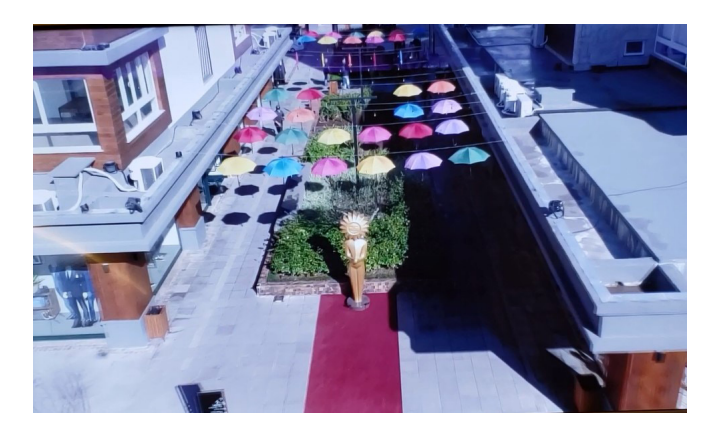
Figura 18. Image taken from the video about the Kikito on display at the Gramado Film Festival Museum, which shows a statue of Kikito in a shopping centre in Gramado