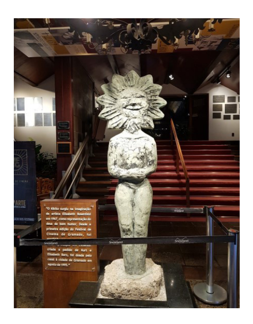
Figure 2. The concrete sculpture of Kikito at the entrance of the Palácio dos Festivais

Walking past the great Kikito, towards the stairs that connect the Palácio dos Festivais to the Museum building, one can see several digital screens with rotating images, displaying banners and posters promoting each of the 50 editions of the Film Festival, as shown in Figure 3.