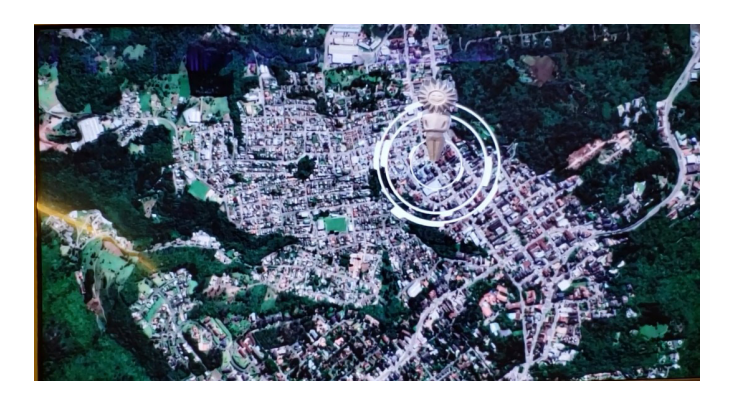
Figura 17. Image taken from the video about the Kikito on display at the Gramado Film Festival Museum, which features statues alluding to the awarding of this festival, located at various tourist spots in the city of Gramado Credits. Manoela Barbacovi and Maria Angélica Zubaran