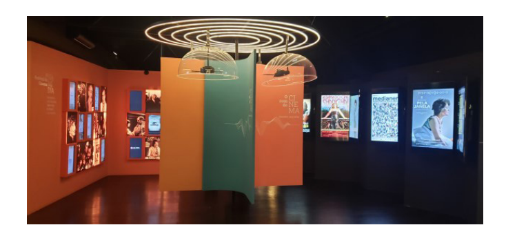
Figure 7. National repercussions of the event's editions (left) and the announcement of the films awarded in the event (right)

As another communicational strategy, digital screens present media highlights for each of the Festival's editions, displaying the posters of the films awarded throughout half a century of the event (Figure 7).