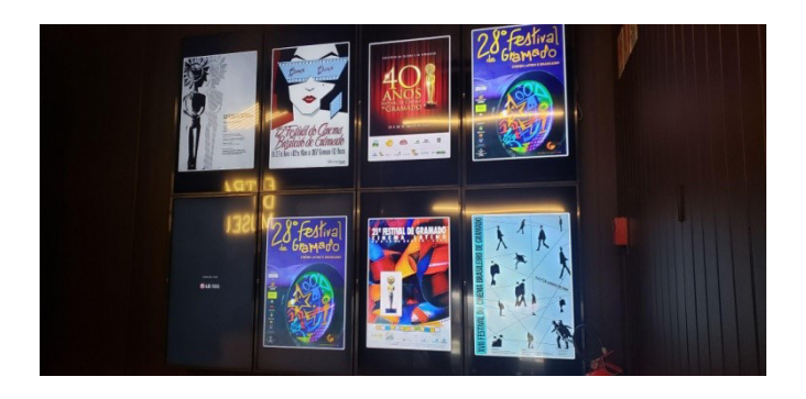
Figure 3. Digital screens displaying the posters advertising the Film Festival's editions

Walking past the great Kikito, towards the stairs that connect the Palácio dos Festivais to the Museum building, one can see several digital screens with rotating images, displaying banners and posters promoting each of the 50 editions of the Film Festival, as shown in Figure 3.