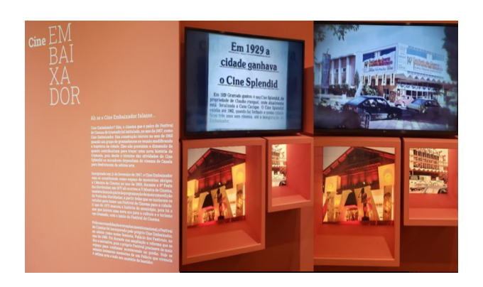
Figure 9 . Introduction to the history of Cine Embaixador Credits . Manoela Barbacovi and Maria Angélica Zubaran

The museographic project also highlights the history of the cinema's establishment in the city of Gramado, from its inception, with the Cine Splendid, through the Cine Embaixador (Figure 9), and the building of the Palácio dos Festivais.