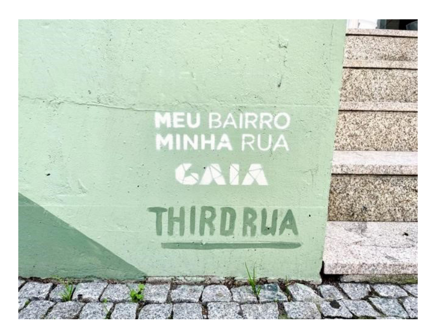
Figure 1. Logo of the project Meu Bairro, Minha Rua, the logo of Vila Nova de Gaia Municipality and the signature of the artist on the Library mural Credits. Ana Castro

divided into four stages: diagnosis, preparation/communication of proposals, implementation and monitoring.