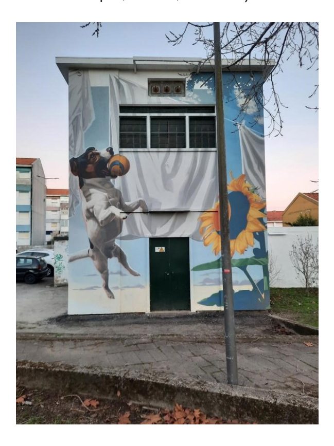
Figure 4. Washerwomen Mural, Cedro neighbourhood, 2021 Crédits. Nuno "Third" Palhas

The second urban art mural (Figure 4, Figure 5 and Figure 6) created for this project was also painted in 2021 by the same artist, this time in the Cedro neighbourhood. In the presentation of this project stage (Câmara Municipal de Vila Nova de Gaia, n.d.-b) in November 2021, the Mayor of Vila Nova de Gaia, Eduardo Vítor Rodrigues, explained that the Ubuntu methodology was adopted to listen to the citizens. They began by making the diagnosis which, according to him, is a "work of proximity", which began in August 2019, intended to listen to people. The Mayor adds, "this listening is much more than a mere issue. It is an interpersonal relationship built from fieldwork that is truly door-to-door work" (GaiaTV Município, 2020b, 00:11:20).