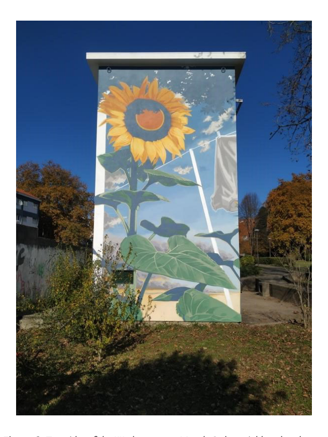
Figure 6. Two sides of the Washerwomen Mural, Cedro neighbourhood, 2021 Crédits. Nuno "Third" Palhas