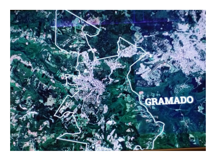
Figura 16. Image taken from the video about the Kikito on display at the Gramado Film Festival Museum, which shows the map of this city