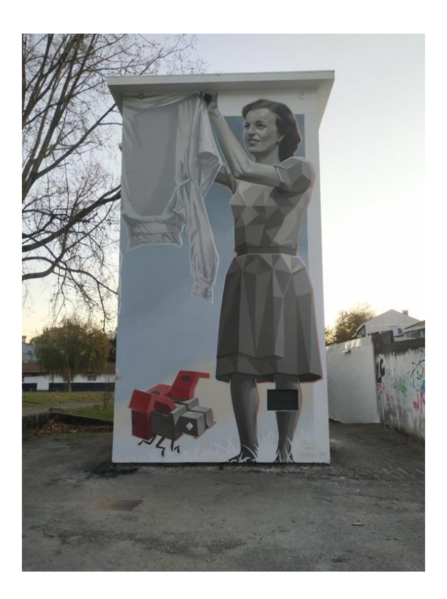
Figure 5. Two sides of the Washerwomen Mural, Cedro neighbourhood, 2021