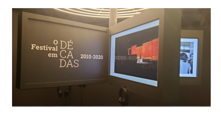
Figure 6. Interactive exhibition of the Gramado Film Festival by decades

As another communicational strategy, digital screens present media highlights for each of the Festival's editions, displaying the posters of the films awarded throughout half a century of the event (Figure 7).