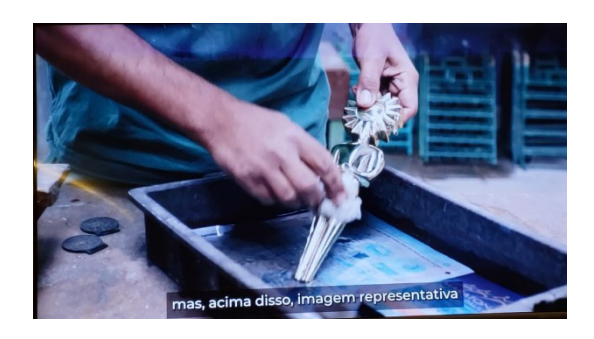
Figure 14. Image taken from the video about the Kikito on display at the Gramado Film Festival Museum, which highlights the importance of this award beyond the scope of cinema

Credits. Manoela Barbacovi and Maria Angélica Zubaran