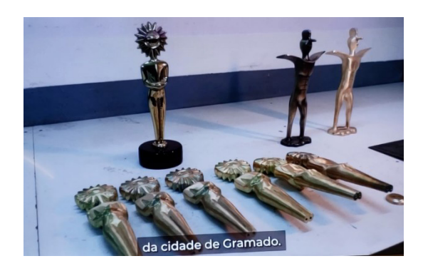
Figura 15. Image taken from the video about the Kikito on display at the Gramado Film Festival Museum, which presents the Kikito as the representative image of the city of Gramado Credits. Manoela Barbacovi and Maria Angélica Zubaran

Credits. Manoela Barbacovi and Maria Angélica Zubaran