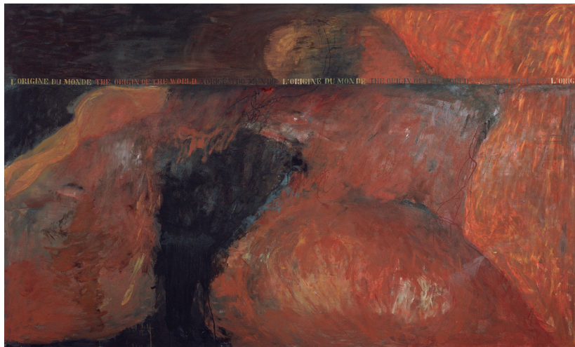
Figure 3: Gênesis, Jeanine Toledo, 2003 – Oil on canvas | 160 x 270 cm 4

In "Gênesis" (Figure 3), the artist uses the strength of the brush and paints L'Origine Du Monde 3 in red and in big dimensions, exposing not only an icon but also an object of research and restlessness.