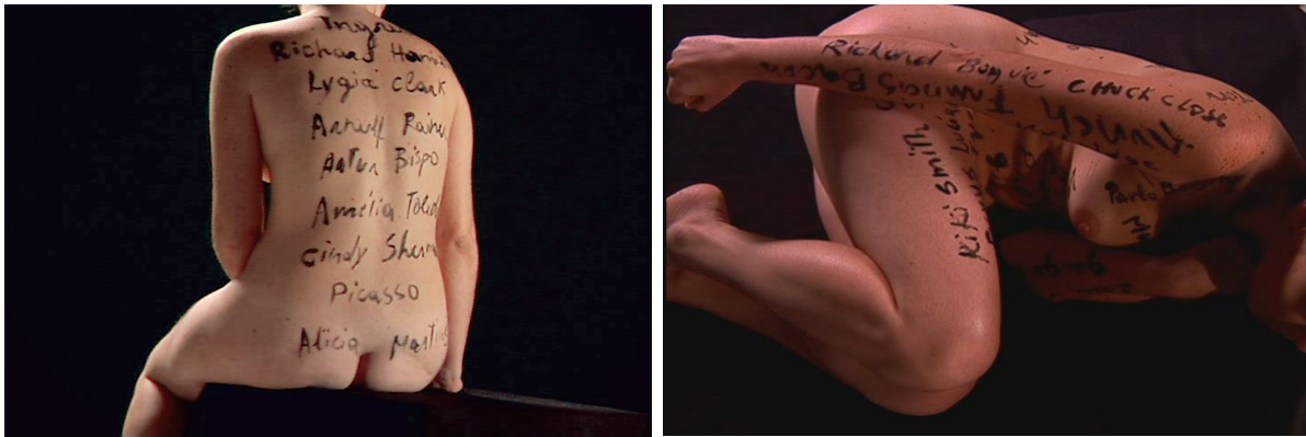
Figure 2: Frames of Uns e Outros, Jeanine Toledo's video, 2003 2

The woman, a recurring subject in a big part of Jeanine Toledo's work (Figure 1 and 2), is a reference and also a support, is color and lightness, protagonist and model. This tireless artist in the search of her representations is meticulous, exigent, perfectionist. She brings us not only reinterpretations of masterpieces; she rewrites them with her own words.