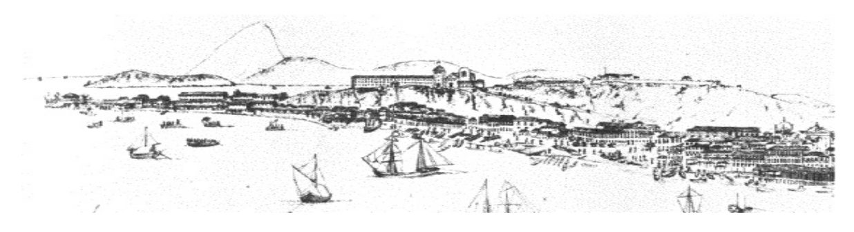
Figure 1: Cove and Port of Rio de Janeiro

conceived by great architects and artists such as Dürer, Miguel Ângelo, Francisco de Giogio Martini or military engineers who know the term classic, although in an economical way, in most cases, entrance and portals of defense works. The beauty of the fortifications does not lie in its decorative repertoire, but in the simplicity and purity of its lines where, as a general rule, no concession was made to the superfluous. The drawing was a slave of the function and therefore of a very great sincerity (Figure 1).