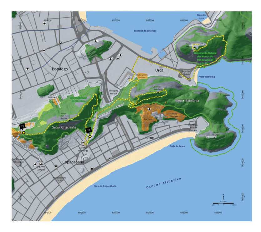
Figure 2: Situation of the hills of Leme, Babilonia, São João and Urubu. Natural Park Carioca Landscape

In order to improve the visitation, the Rio de Janeiro State Environment and Conservation Secretariat (SMAC) requested a study from the Federal University of the State of Rio de Janeiro (UNIRIO) foreseeing management strategies for three Carioca Conservation Units (UC) abandoned by the public power: the Areas of Environmental Protection – APA of the Morro São João and Babilônia and the Leme and Urubu and the State Park of Chacrinha (PEC). The results of this study (Sinay et al., 2012) established the creation in 2013 of the Municipal Natural Park of the Carioca Landscape by Decree n°. 37,231, being the first Park created in Brazil based on sociological / tourism studies and not deep biological studies, as usual until then (Figure 2).