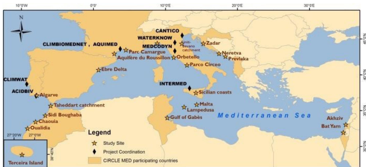
Figure 1: Geographical area of the projects and their case studies

Figure 1 localizes the coordinators of the projects, the number of partners included in each project and the localisation of the case studies.