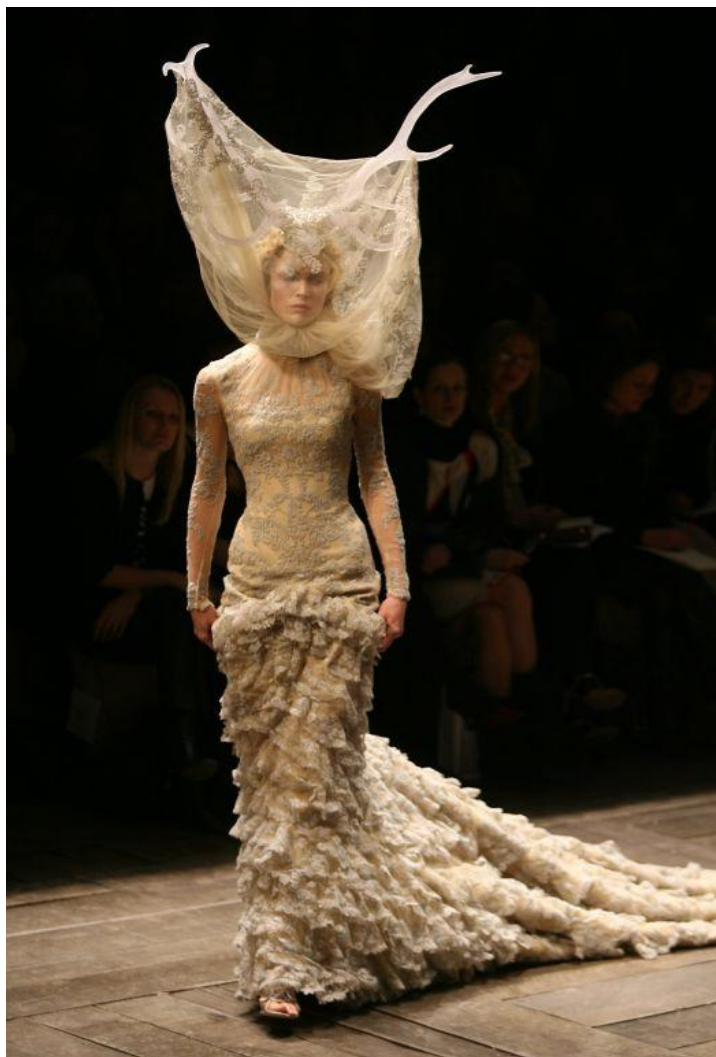
Image 10. Alexander McQueen. www.alexandermcqueen.com/

In these last figures, the trait which is most accentuated is that of human hybridity with objects and animals. Furthermore, it can be described as "fundamental to grotesque images is the particular concept of the whole body and its limits. The boundaries between the body and the world, and between different bodies, are traced in a completely different manner to those of classical and naturalistic images" (Bakhtin, 1970: 314). The grotesque character of these forms is manifested by the way in which the animal invades the human, to the point of merging with it, creating monstrous