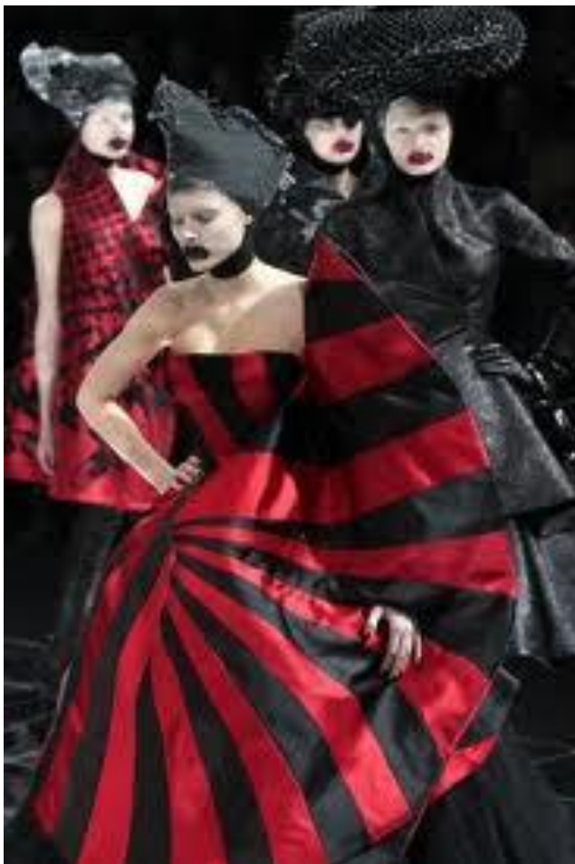
Image 6. Alexander McQueen. www.alexandermcqueen.com/

The grim colour palette of black and red is also used in this second image, but is now even more garish and demonic. The dense swathes of material remain, frequently with pleats; the hair is covered with a mixture of grotesque, baroque forms. The eyes are shrouded in darkness, black holes, as if they were skulls. The rouged lips all seem to have been kissed by death. The faces and skin on the arms and shoulders, emerging from beneath generous ruffles and folds of material, are of an unhealthy pallor.