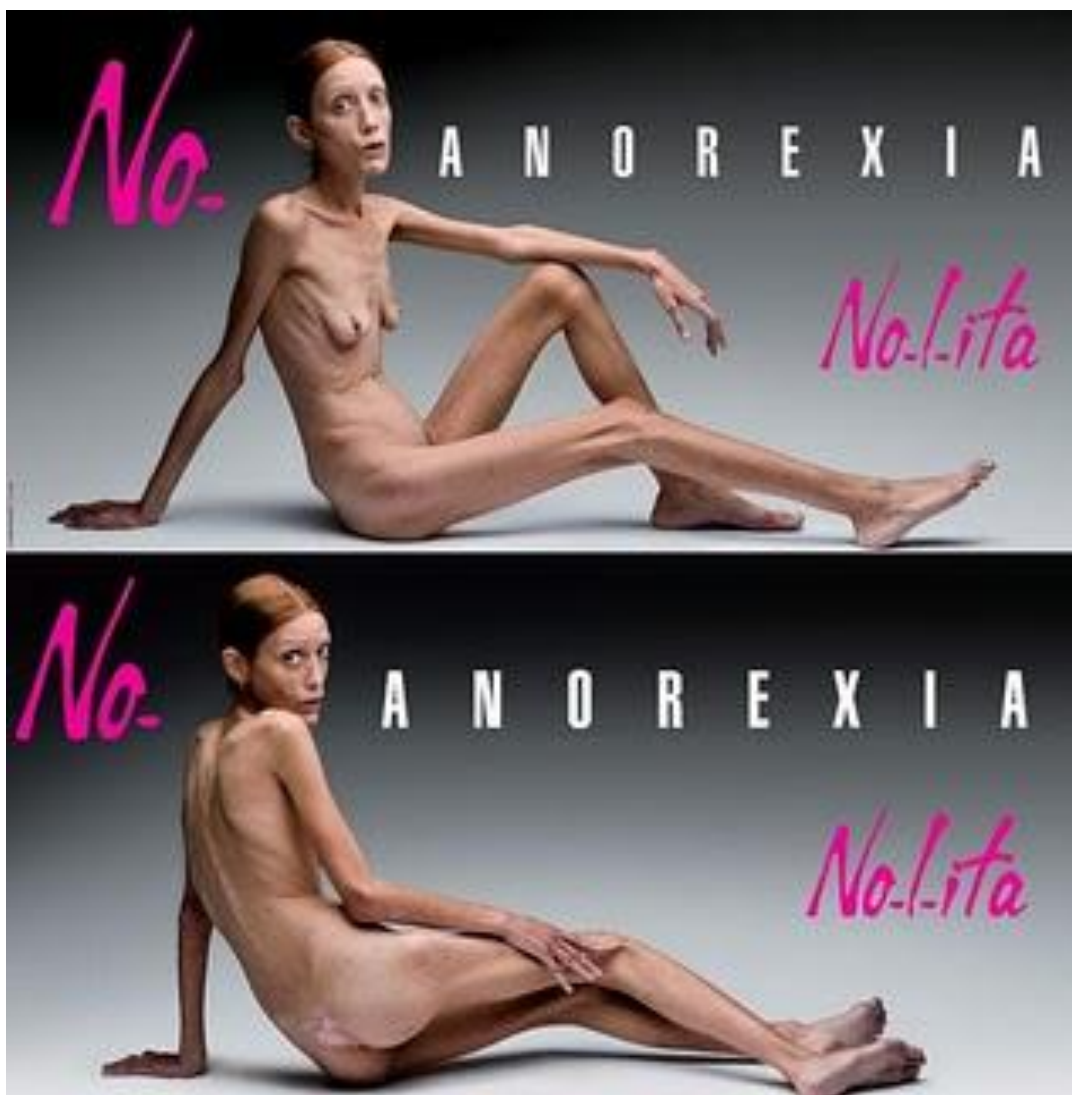
Image 4: Publicity campaign with an anorexic model, for the brand Nolita, in September 2007. Oliviero Toscani.