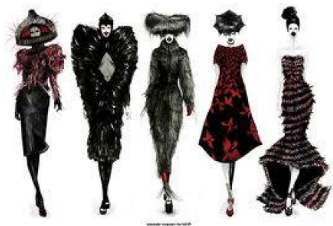
Image 5. Alexander McQueen. www.alexandermcqueen.com/

is strongly manifested, to the extent that death is a constant suggestion in practically all of them.