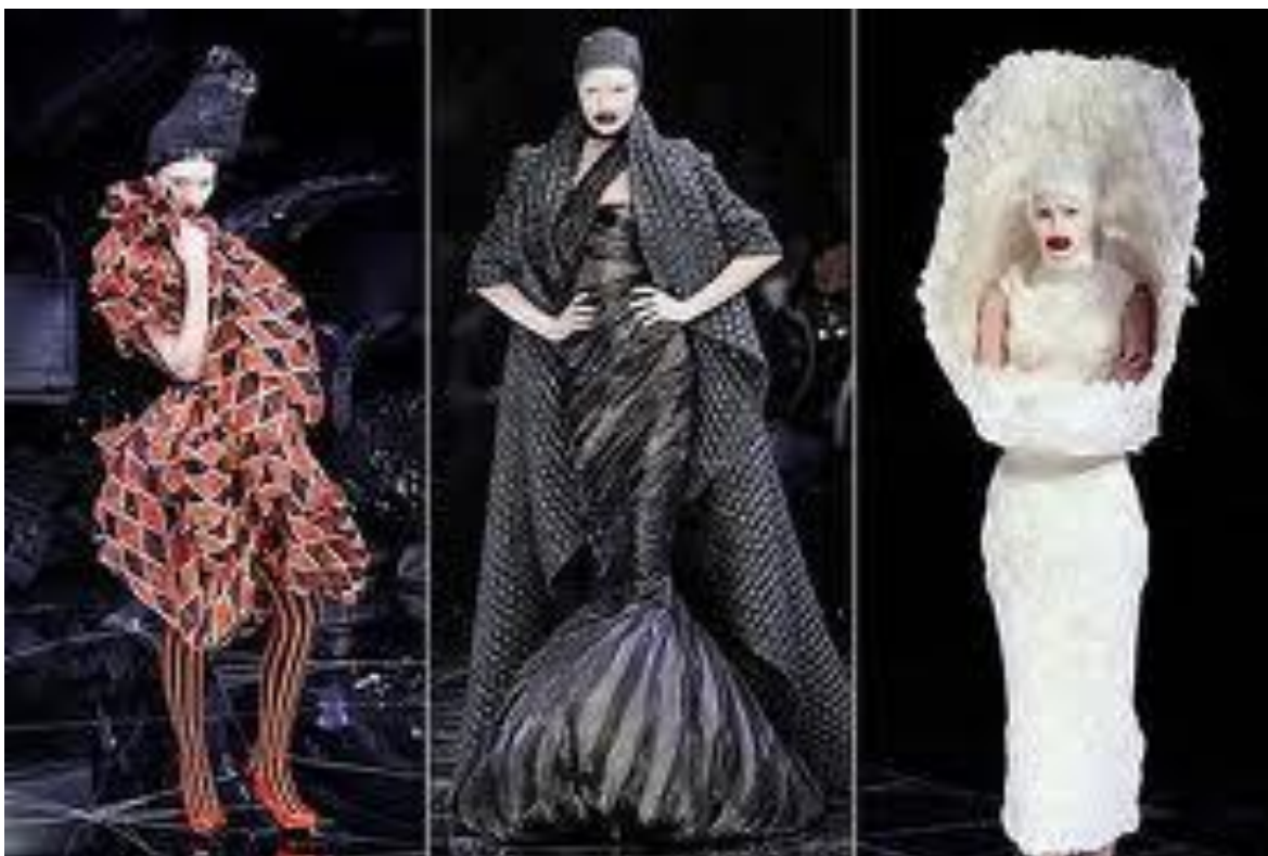
Image 7. Alexander McQueen. www.alexandermcqueen.com/

In this third image, the two models on the left retain the unhealthy skin pallor, the black eyes, and the kiss of death on their lips, the ruffles and shades of black and faded red, particularly the first model, who appears somewhat satanic. The third model resembles a mummy, swathed in white, as though ready for burial. The three models maintain grotesque, if ambiguous characteristics, with the second and third models suggesting an enigmatic stage of transformation.