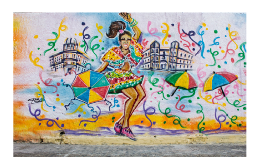
Figure 4: Rua Barbosa Lima St., n. 81. Protected set in Bairro do Recife, after the intervention (9/9/2018)