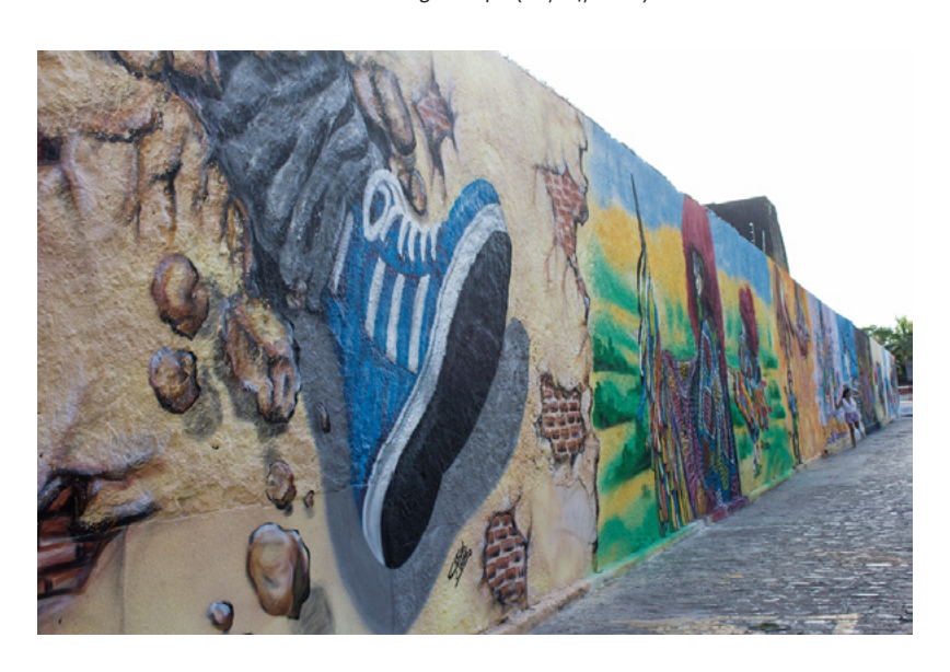
Figure 3: Rua Barbosa Lima St., n. 81. Protected set in Bairro do Recife, after the intervention (9/9/2018). Detail with approximation