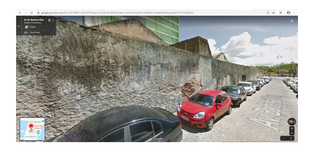
Figure 2: Barbosa Lima St., n. 81. Protected set in Bairro do Recife