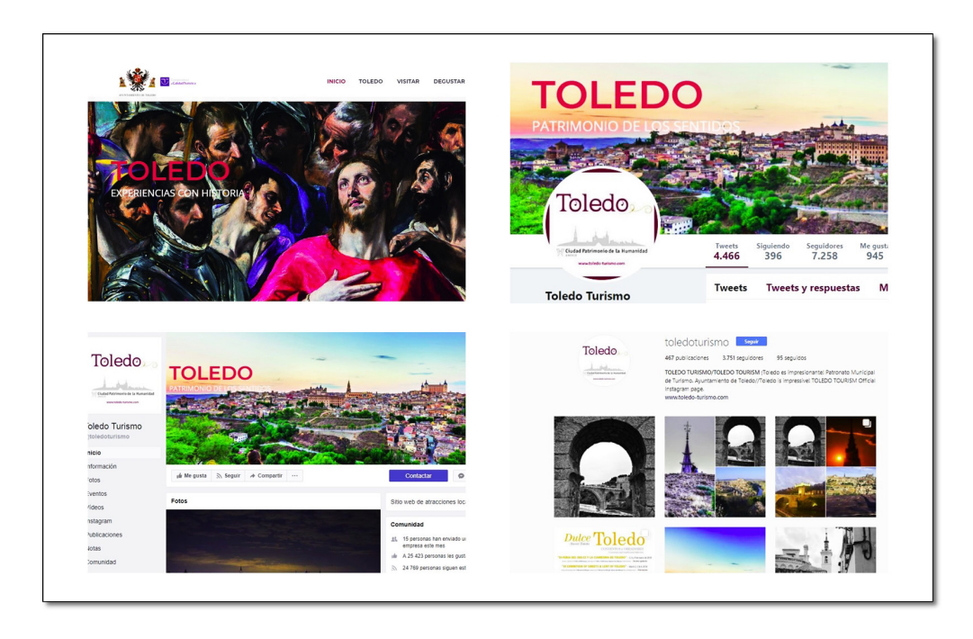
Figure 1: Promotion of Toledo in the internet site of Toledo's Municipal Tourist Board: encompasses its website, Twitter, Facebook and Instagram

destination of the region (Esteban Talaya et al., 2011). The city's public image has been built on the basis of these heritage resources. The Toledo DMOs has made major efforts to consolidate a strong and positive image for the destination. This has been achieved, primarily by the Municipal Tourist Board ("Patronato Municipal de Turismo")<sup>2</sup>, whose main focus is to promote tourism to the city and strengthen the Toledo brand. This is achieved, for example, via its presence in major tourism fairs, such as FITUR (International Tourism Fair) in Madrid or ITB (International Tourism Börse) in Berlin, or through maintenance of its digital portal and social networks (Toledo Municipal Tourism Board, 2018).